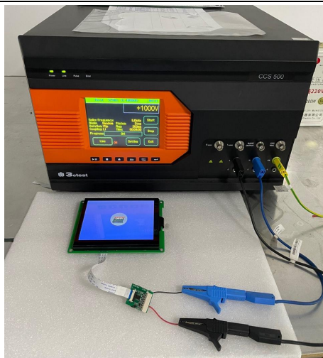
3.2 群脉冲测试图 EFT test